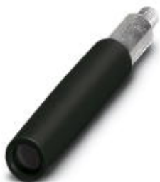
Female test connector, color: black

Please be informed that the data shown in this PDF Document is generated from our Online Catalog. Please find the complete data in the user's documentation. Our General Terms of Use for Downloads are valid ( http://phoenixcontact.com/download )